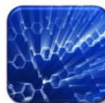
Small molecules /Polymer